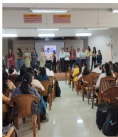
Day 2: Training and Practice session on Group discussion and mock interviews