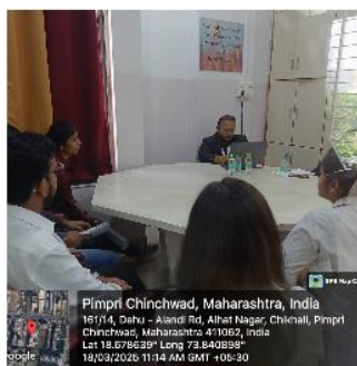
Pimpri Chinchwad, Maharashtra, India 161/14, Dehu - Alandi Rd, Alhat Nagar, Chikhali, Pimpri Chinchwad, Maharashtra 411062, India Lat 18.678539° Long 73.840996° 18/03/2025 11:14 AM GMT +05:30