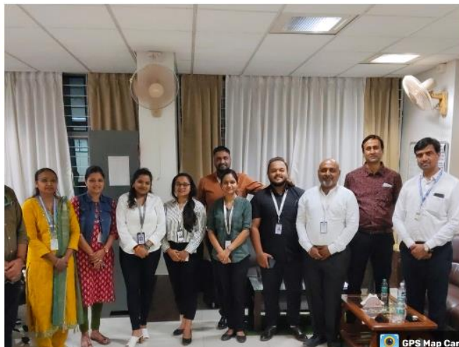
GPS Map Camera