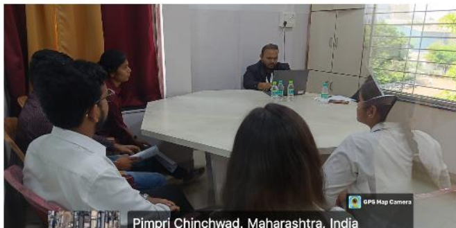
Pimpri Chinchwad, Maharashtra, India