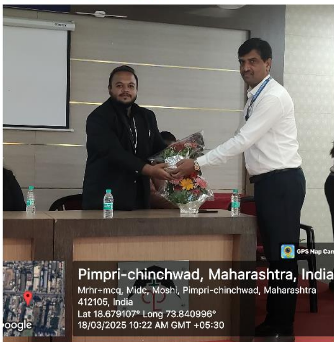
GPS Map Camera