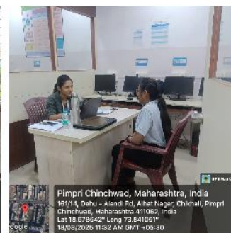
Pimpri Chinchwad, Maharashtra, India 161/14, Dehu - Alandi Rd, Alhat Nagar, Chikhali, Pimpri Chinchwad, Maharashtra 411062, India Lat 18.678542° Long 73.841001° 18/03/2025 11:32 AM GMT +05:30