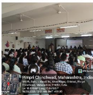
Pimpri Chinchwad, Maharashtra, India 161/14, Dehu - Alandi Rd, Alhat Nagar, Chikhali, Pimpri Chinchwad, Maharashtra 411062, India Lat 18.678539° Long 73.840996° 18/03/2025 07:01 AM GMT +05:30