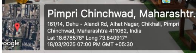
Pimpri Chinchwad, Maharashtra.. 161/14, Dehu - Alandi Rd, Alhat Nagar, Chikhali, Pimpri Chinchwad, Maharashtra 411062, India Lat 18.678578° Long 73.840917° 18/03/2025 07:00 PM GMT +05:30