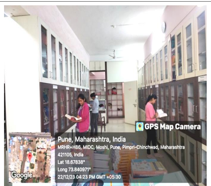
Library Access by Students