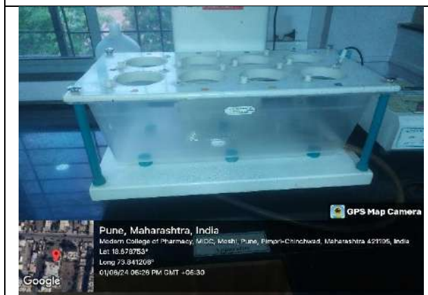
Dissolution test apparatus