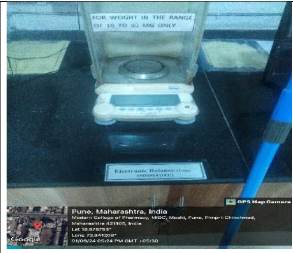
Electronic weighing balance