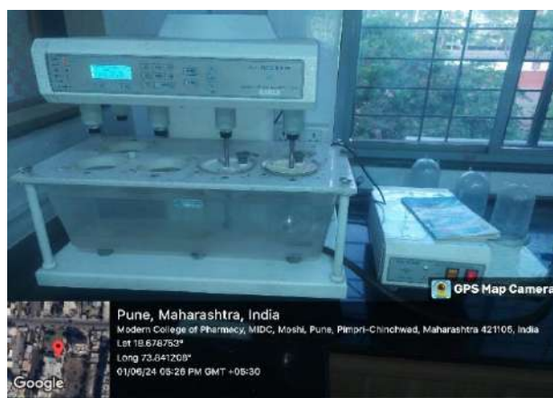
Dissolution test apparatus