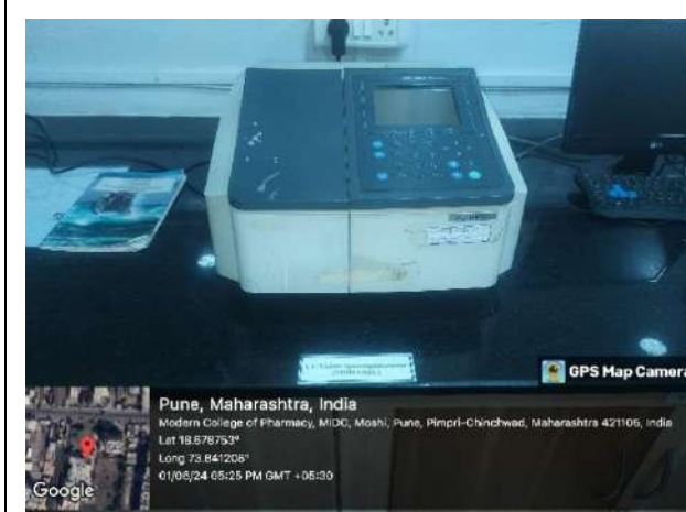
UV Visible Spectrophotometer